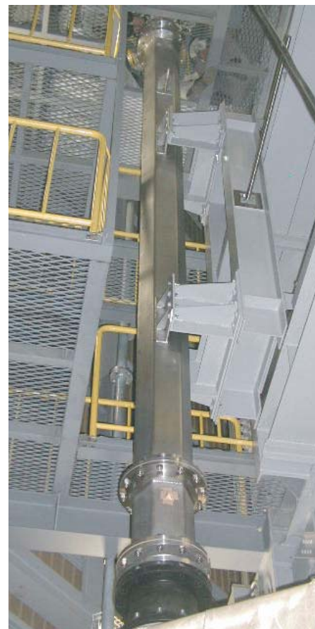
Fig.3 Testsection of full mock-up fuel sub-assembly water test (Length of sub-assembly: 5.0m)