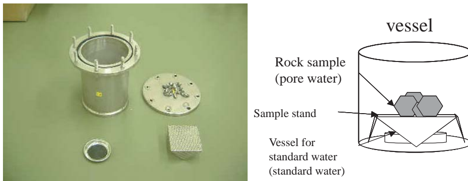
Fig.1 Vessel used for isotopic exchange method

Rock sample and standard water (that has known isotopic composition) are enclosed in the vessel. Then isotopic exchange reaction takes place through vapor. After exchange reaction reaches to equilibrium, isotopic composition of pore water in rock sample and standard is the same. Thus the information of isotopic composition of pore water is extracted to standard water.