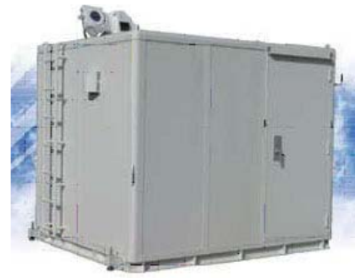
Large Doppler LIDAR device