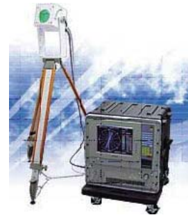
Small Doppler LIDAR device