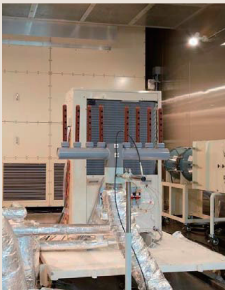
Fig. 2: Prototype of the CO 2 heat pump for a central heating system tested at heat pump performance test facilities

The figure shows schematically the increase of heat pump unit power consumption from start to finish for water heating (thermal storage). The heat pump unit power consumption at the rated inlet water temperature and the low outlet water temperature is the smallest ( E_1 , rated power consumption). However, in actual operation, the outlet water temperature becomes high to ensure the storage of heat needed. Further, due to the influence of hot water remaining in the hot water tank, the actual inlet water temperature becomes high. Because of these, heat pump unit power consumption is increased ( \Delta E_1 , \Delta E_2 ). A quantitative analysis of the system COP can be done by evaluating each of these effects. The proposed evaluation method can also be applied to various types of Eco-cute.