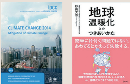
Fig. 2: IPCC report to which CRIEPI contributed and the book "Dealing with Global Warming"

The role of voluntary action by the industry of Japan as a policy instrument is identified as a complimentary policy to the other policy instruments such as carbon pricing and energy conservation law.